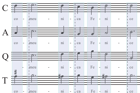
Figure 2: Example of homorhythmic madrigalism (HOM) in Giovannelli’s madrigal. The voices C (Canto), A (Alto), Q (Quinto), and T (Tenor) perform the same musical-linguistic pattern simultaneously to musically mimic the lyrics’ content. Notice that all the voices are written in treble clef (for T subctave).

tures. These motifs are characterised by specific rhythms and melodic contours that musically mimic the meaning of the lyrics, both linguistically (e. g., love as positive and hate as negative), and metaphorically (e. g., the word green as a synonym for life); thus, we refer to these motifs and their related lyrics as ‘musical-linguistic patterns’. The musical texture determines how the musical-linguistic patterns interact between them across the different voices. Since other ‘word painting’ strategies, as e. g., those based on melodic contour and chromatism [14], are not as representative of the presented anthology as those based on musical texture, only madrigalisms which relate to the alternation of musical textures will be taken into account for the annotations. For an evaluation of more ‘typical’ madrigalism, as those based on chromatism, repertoire from the 17 th century should be considered.